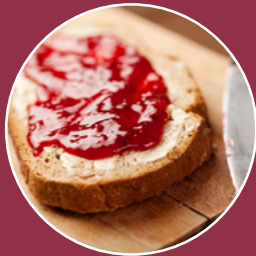
Jams & Sauces