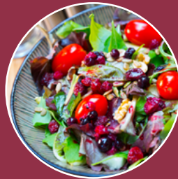
Salads & Toppings