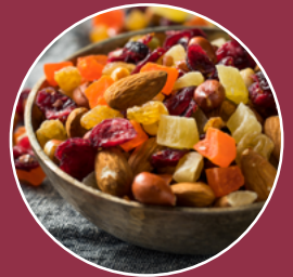
Trail Mix & Snacks