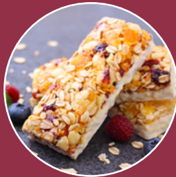
Nutrition & Snack Bars