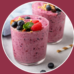
Beverages & Smoothies